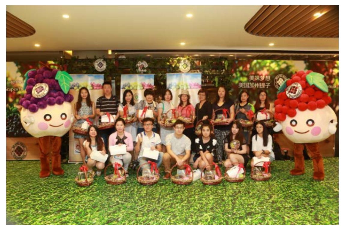
Photo of some Medias and KOLs who have participated in the Mid-Autumn Taste the Dream event.

mooncakes by adding infinite creative elements.