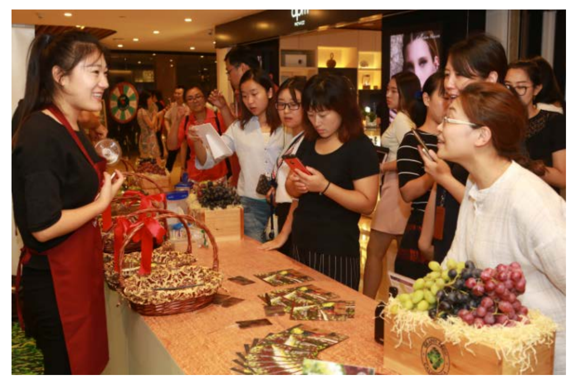
Lively interaction with Chinese consumers.

The appreciation of California grapes begins by pursuing a dream and ends in the fulfilment by tasting the dream of California grapes.